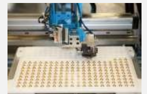
Load / Unload