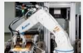
Load / Unload